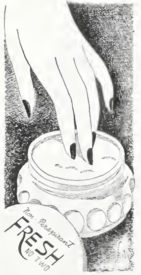
FRESH #2 comes in three sizes—50¢ for extra-large jar; 25¢ for generous medium jar; and 10¢ for handy travel size.

Are you sure of your Put FRESH #2, the new present deodorant? double-duty cream, un-Test it! Put it under der this arm. See which this arm. stops perspirationprevents odor-better! Use Fresh and stay fresher!